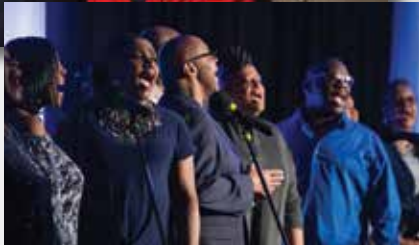
DOXA Gospel Ensemble