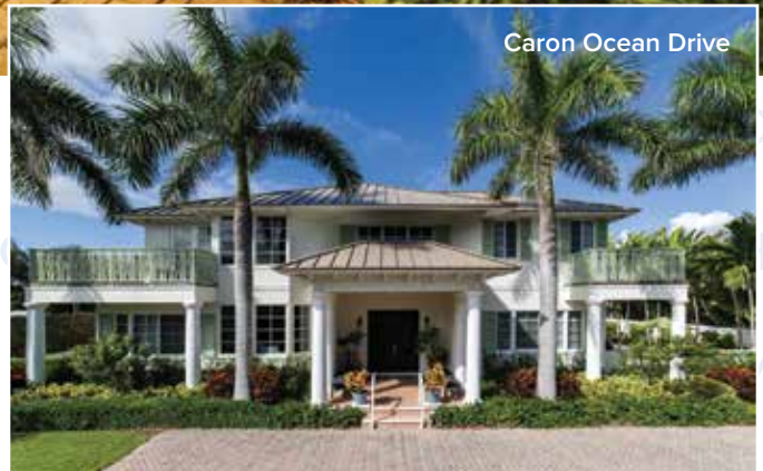
Caron Ocean Drive