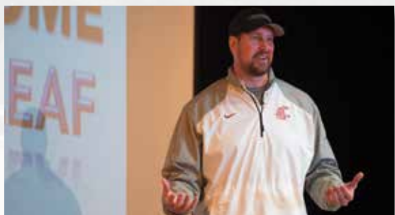
Former NFL Quarterback Ryan Leaf kicks off the Peak Performance Leadership Academy