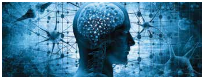
THE SCIENCE OF ADDICTION

A focus on expert content was instrumental in engaging key audiences and establishing Caron as a thought leader for families, clinical professionals and the addiction treatment sector. Videos, articles and tips were developed and published on multiple outlets such as WebMD, to build Caron's brand and drive interest in its programs. Radio and online advertising rounded out the marketing plan for fiscal year 2018.